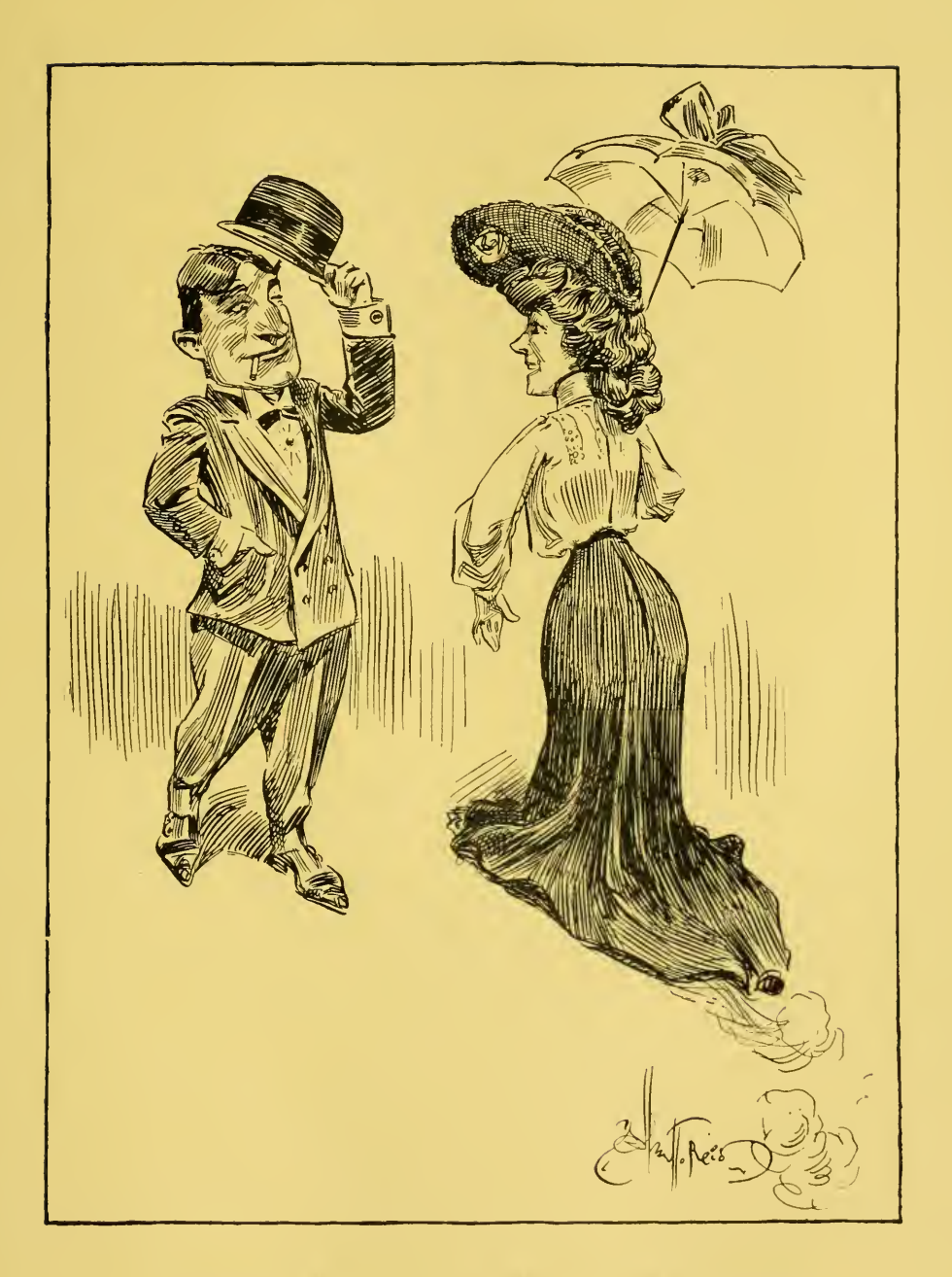
THE HANDSOME KNIGHT SHE MET IN ELMDALE PARK